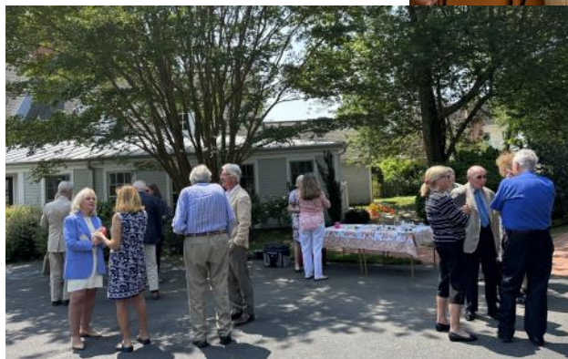
After Service Fellowship