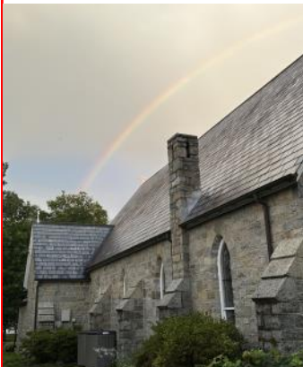
Rainbow Graces Holy Trinity