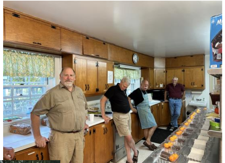
Soupmeisters Hard At Work