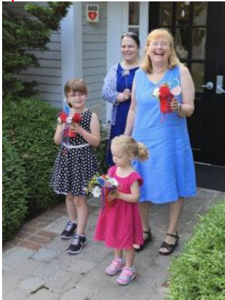
Flower Girls for our Ser-