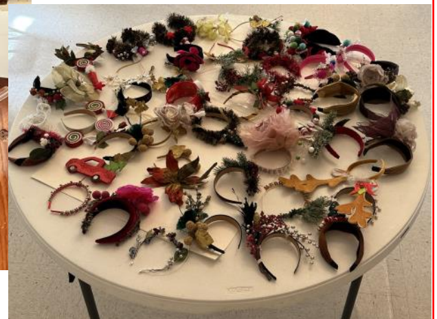
Uniqueness and Wide Selection of Fascinators