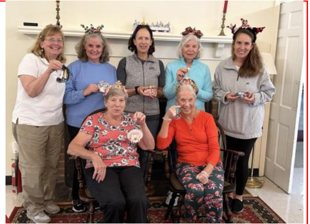
Fascinating Day at the Craft Tables!