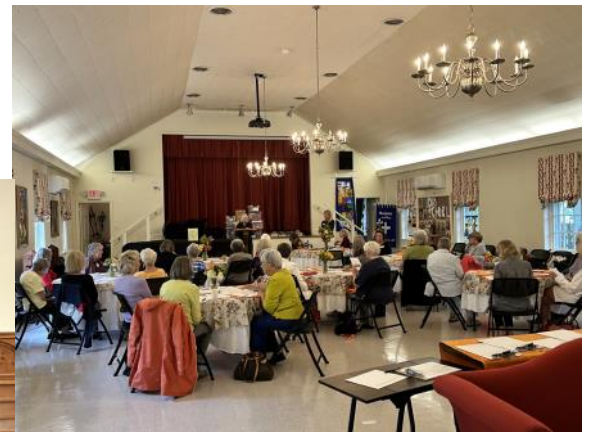
The Women of Holy Trinity Luncheon