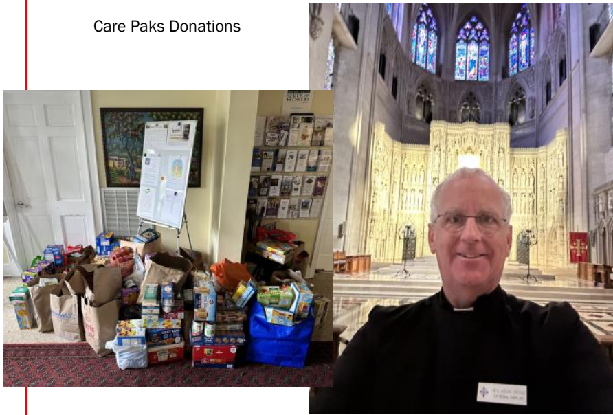
Care Paks Donations