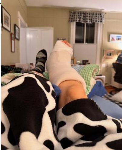
Big Foot Lives Here