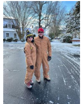
Mactavash Snow Crew