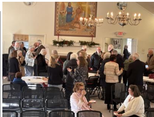
January Fellowship Hour