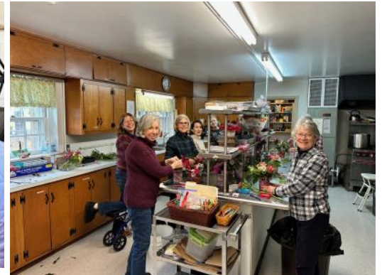
Garden Club Making Arrangements for Our Lunch Bunch Deliveries