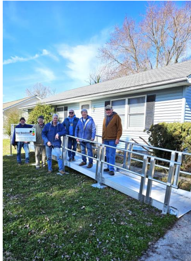
Bay Hundred Volunteers