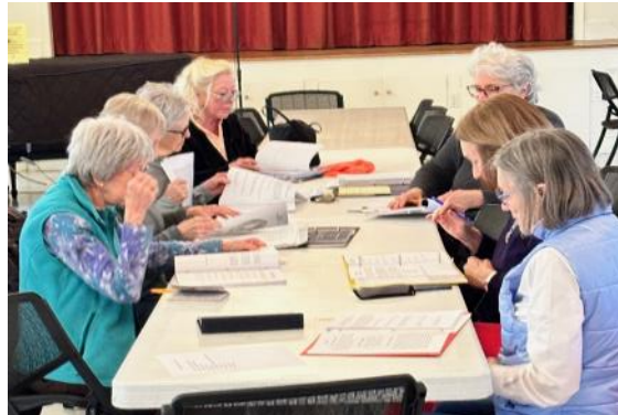
Daughters of the King