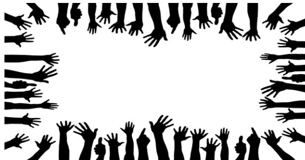
Many hands make light work!