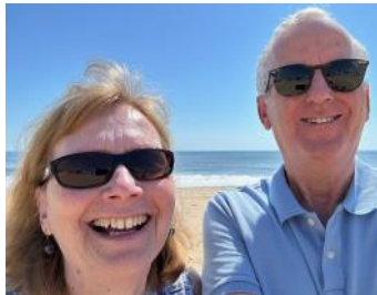
At Diocese Convention