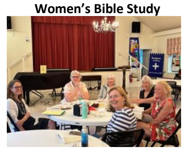
Women's Bible Study