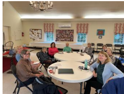
Women on a Journey