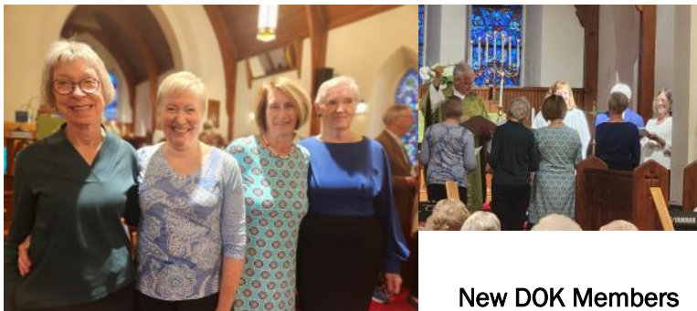
New DOK Members