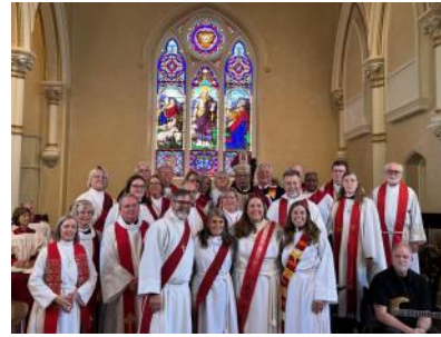
Dio. Deacon Ordinations