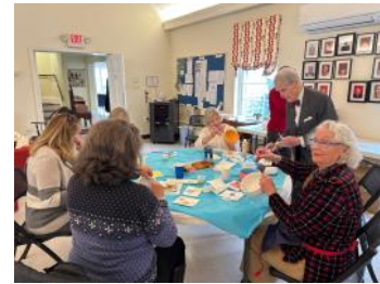
Empty Bowls Painting Party