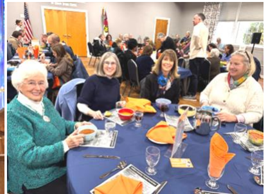
Empty Bowls Painting Party