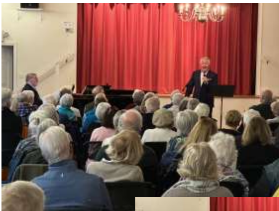
Concerts and Guest Musicians