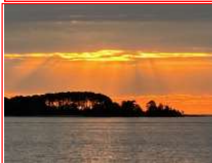
And God Said Let There Be Light