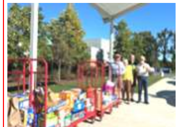
Care Pack Delivery Team