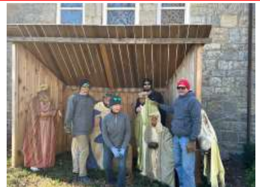
Mactavish Crèche Crew