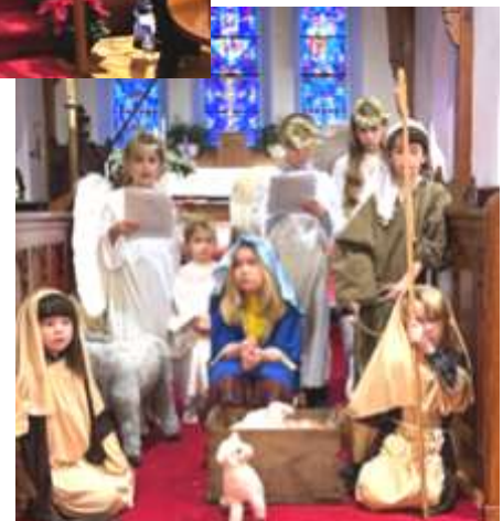
Sunday School Pageant