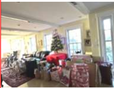
Angel Tree Gifts